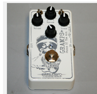
Gramps+ Fuzztortion Grande

amount of effect and the overall level(s) To make this possible I apply the effects in parallel mode, through “ FEKTO ” connected last in the chain.