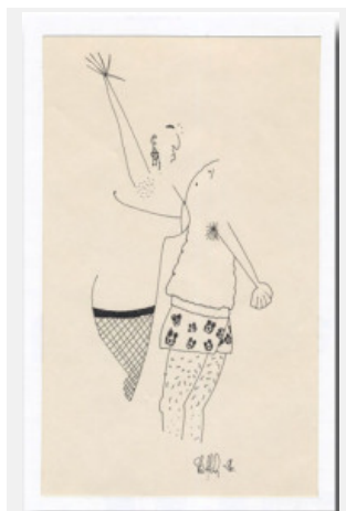
The original artwork from 1986

The bird layout was quite a coincidence. As the ending of the word “HimmelSTRUTZ” reminds of “STRUTS” (=ostrich in Swedish) the artwork just had to be like that. My dad arranged the original artwork, which looked like this: (See right)