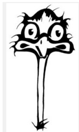
Joakim's father's drawing of the ostrich

Now and then this bird changes, and sometimes also the names of the pedals, which more or less reflects the mood of the day or season. Even if It’s a great joy making all the way original pedals it’s possible to get a little bored with some details. Therefore these changes can occur, at any time. It’s also a good way for developing new pedals. Some variants of the bird are: