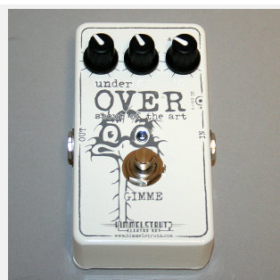
Under Over booster

I would say it works the way you want it to work. Personally I like to switch the order of most of them, depending on what to be solved that specific day. Some times I need to boost a drive pedal – why not with some extra pre eq, “ under OVER ” (UO), and other days I prefer to route the boost/eq – and/or the opto dynamic booster, “ miss nutCRACKer ” (MNC), after the dirt section which would be a “ FETTO “, “ GRAMPS+ “